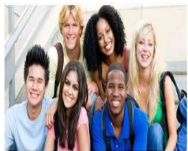
Student of the Year